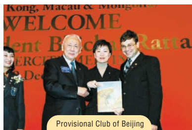
Provisional Club of Beijing 北京臨時社