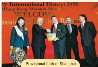
Provisional Club of Shanghai 上海臨時社