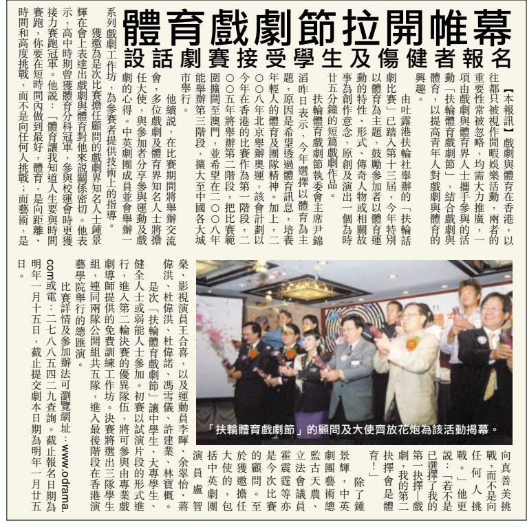
Tai Kung Pao (Cultural & Education)

The event encouraged participants to perform a 25-minutes drama with anoriginal script, incorporating sports, informor inspirit, orasalegendary to enter into a competition with the preliminary audition in February, the finals in April and May, and a grand performance in August 2003. A series of forums and workshops would jointly organized with the Jockey Club Continuous Life-wide Learning Centre and the Chung Ying Theatre, providing technical support to all participating teams. The forums in the first stage were organized on 8th and 15th December, 2002. In addition, famous Hong Kong dramatists and sportsmen/sportswomen have been appointed as advisors or ambassadors and they would share their experience with participants.