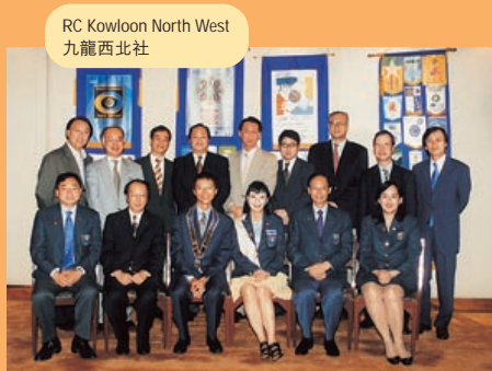
RC Kowloon North West 九龍西北社