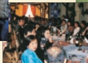
Meeting with Mayor of Ulaanbaatar 拜會烏蘭巴托市長