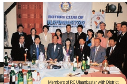
Members of RC Ulaanbaatar with District Officers 烏蘭巴托社友與區職員