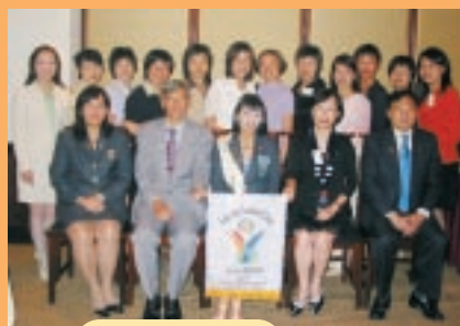
RC Bayview Sunshine HK 香港海景驕陽社