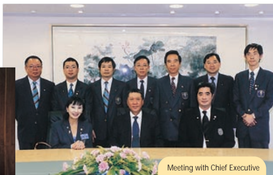
Meeting with Chief Executive of Macau SAR 拜會澳門特首何厚鐸先生