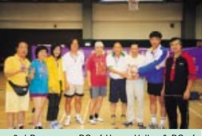
3rd Runner-up: RC of Happy Valley & RC of Channel Islands & RC of Tsuen Wan 殿軍:快活谷社/離島社/荃灣社斷隊

2nd Runner-up: RC of Tolo Harbour 季軍:吐露港社