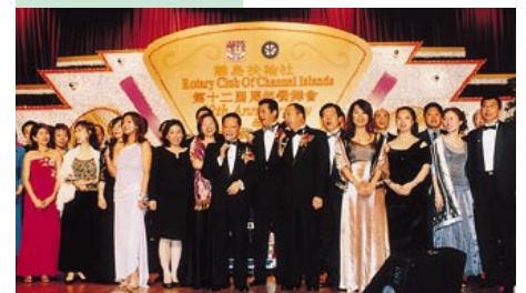
Annual Ball, RC Channel Islands 離島社周年餐舞會