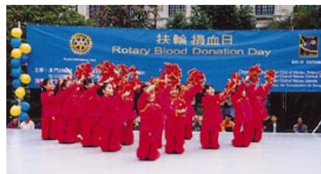
Performance by children 兒童表演中國舞