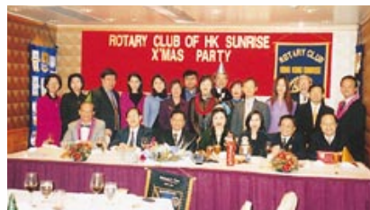
DG at the X'mas party 總監聖誕聯歡