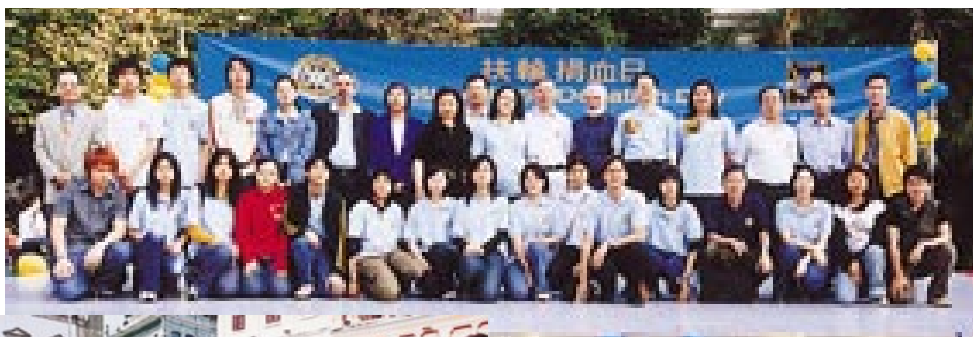
Rotarians & Rotaractors 部份出席社友及扶青團員