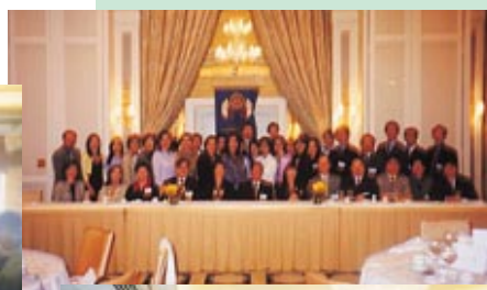
半島南社 DG official visit to Rotary Club of Peninsula South