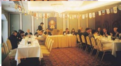
半島社 DG official visit to Rotary Club of Peninsula

人道、教育及文化交流等計劃，扶輪基金具有支持國際扶輪達成國際間的瞭解及世界和平的努力的使命。扶輪基金一共有十七項計劃，本地區社員最熟悉參與的有：扶輪大使獎學金、團體研究交換計劃、配合獎助金、救助獎助金、和平計劃、根除小兒麻痺等疾病，以至小兒麻痺之友等。