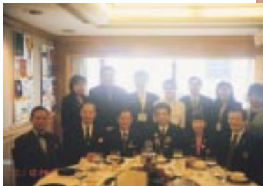
灣仔社 DG visit to Rotary Club of Wanchai