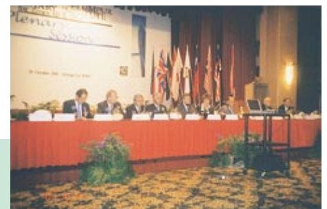
台上國際扶輪社長、副社長、理事及基金信託人等 R. I. President, Vice-President, Director and Trustee at the Rotary Institute