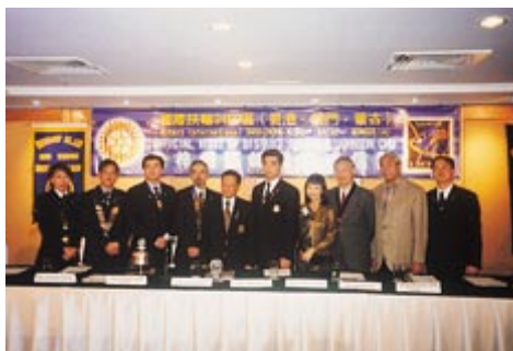
總監公式訪問澳門六社 DG official visit to the Rotary Clubs in Macau