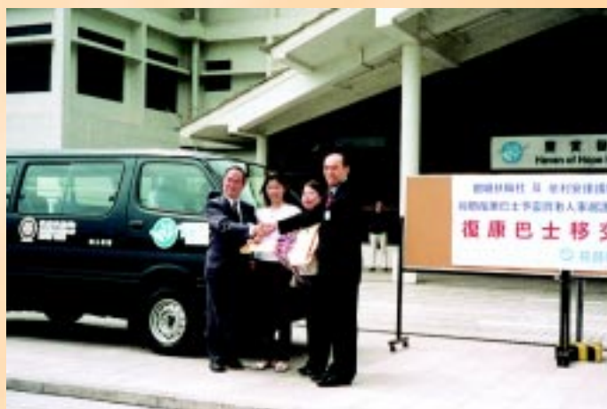
PICTURE OF THE RE-HABILITATION SERVICE BUS PRESENTED - A COMMUNITY SERVICE PROJECT OF THE ROTARY CLUB OF KWUN TONG.