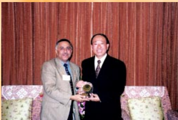
SOUVENIOR PRESENTATION TO VICE MINISTER XU RUIXING OF THE MINISTRY OF CIVIL AFFAIRS IN BEIJING.