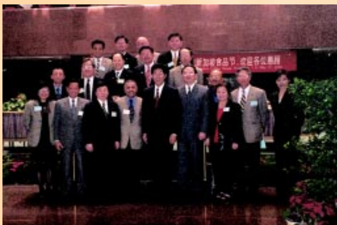
OFFICIAL GROUP PHOTO OF DELEGATION WITH BAYIN CHAOLU, PRESIDENT OF THE ALL-CHINA YOUTH FEDERATION.