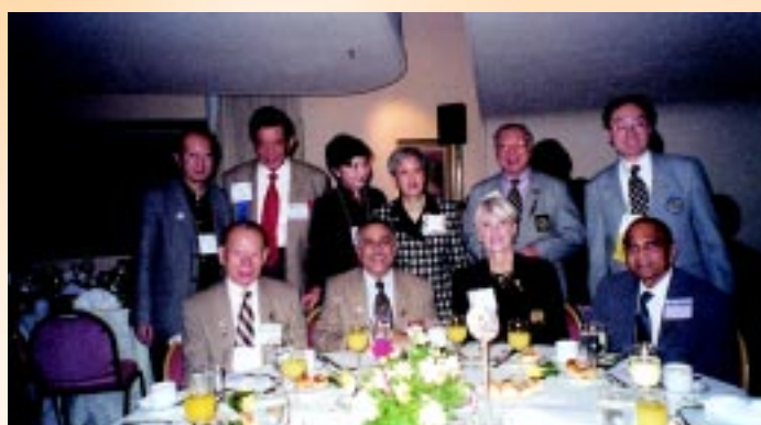
ATTENDING THE ZONE 4, 5, 6 AND 7 FELLOWSHIP "ARGENTINA TANGO BREAKFAST".