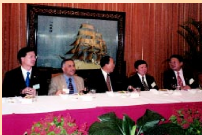
OUR GROUP BEING HOSTED BY ZHANG TINGHAN, DEPUTY HEAD OF THE UNITED FRONT WORK DEPARTMENT OF THE CPC CENTRAL COMMITTEE.