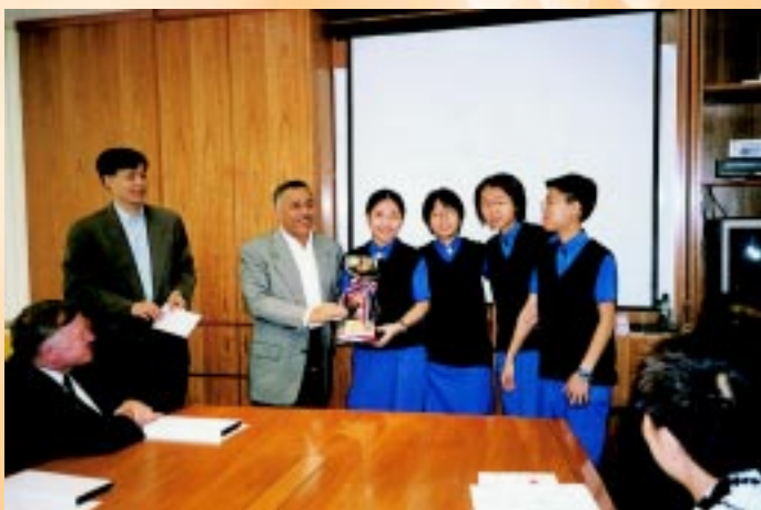
WINNERS OF THE "WEB SITE CREATION COMPETITION" - A ROTARY CLUB OF HONG KONG ISLAND WEST COMMUNITY SERVICE PROJECT.