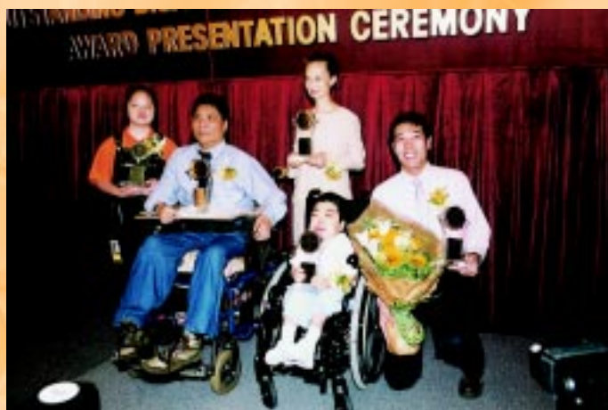
WINNERS OF THE "OUTSTANDING DISABLED PERSONS AWARD 2000" - A ROTARY CLUB OF ADMIRALTY COMMUNITY SERVICE PROJECT.