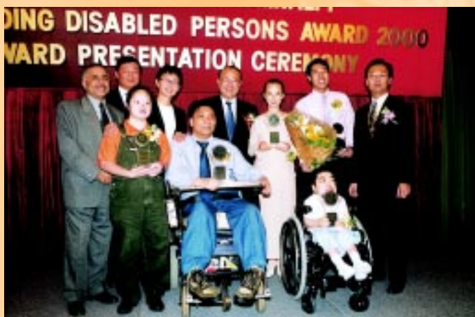
GROUP PHOTO OF THE JUDGES AND WINNERS OF THE OUTSTANDING DISABLED PERSONS AWARD COMPETITION.