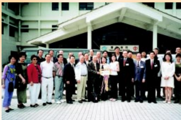
MEMBERS OF THE ROTARY CLUB OF KWUN TONG AT THE PRESENTATION CEREMONY OF THE RE-HABILITATION SERVICE BUS TO THE HEAVEN OF HOPE CHRISTIAN SERVICE.