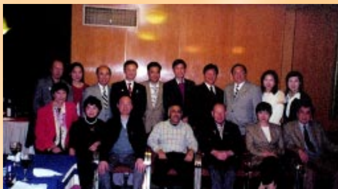
MEMBERS OF DISTRICT 3450 DELEGATION ENJOYING FELLOWSHIP AT THE CONVENTION IN BUENOS AIRES.