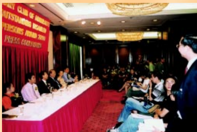
OUTSTANDING DISABLED PERSONS AWARDEES AT THE AWARD PRESENTING CEREMONY NEWS CONFERENCE.