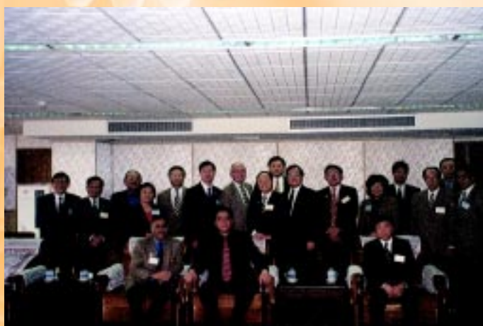
DELEGATION GATHERS TOGETHER FOR A GROUP PHOTO WITH MINISTRY OFFICIALS.