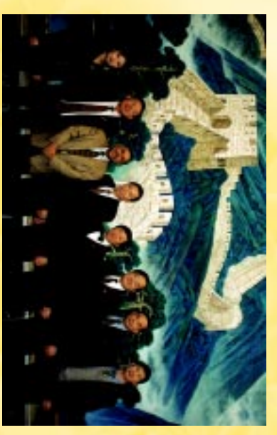
Meeting with Menbers of the Ministry of Health in Beijing - January 13th 2000