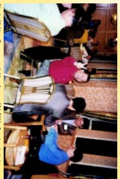
District Mahjong Tournament - held on January 15th 2000 - Rotarians in Action