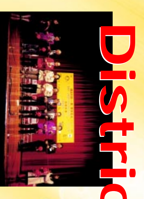
Preserve Planet Earth's Web Page Design Competition organized by R.C. of Shatin -Launching Ceremony by the Hon. Rita Fan - January 9th 2000