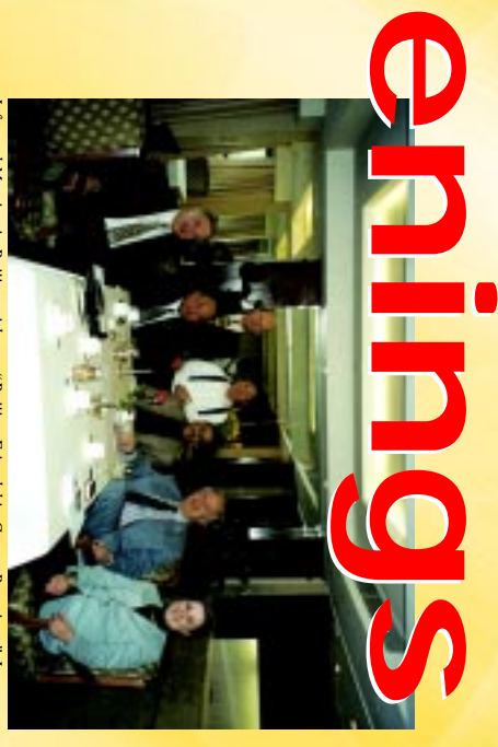
Informal Meeting in Beijing with our "Beijing Friendship Group Rotarians" January 13th 2000