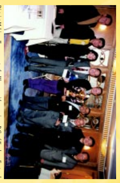
District Mahjong Tournament - the Winners with organizers R.C. of Kowloon East and Kowloon West