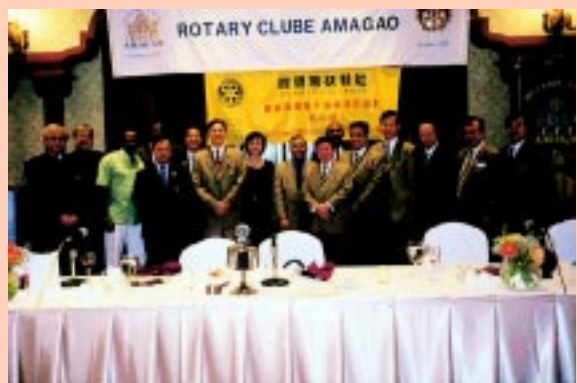
DG Visit - Rotary Club of Amagao October 4, 1999