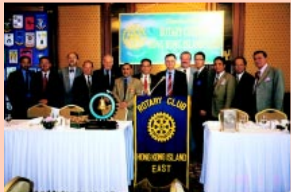
DG Visit - Rotary Club of Hong Kong Island East September 30, 1999