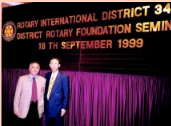
Rotary Foundation Seminar September 18, 1999 Host Club - RC of New Territories