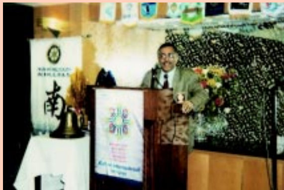
DG Visit - RC of Hong Kong South September 23, 1999