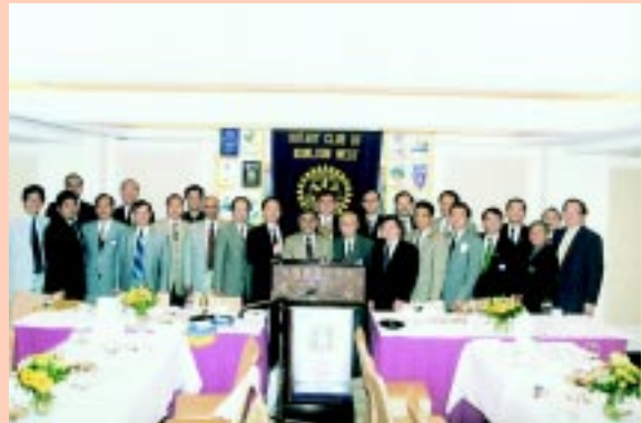
DG Visit - RC of Kowloon West September 8, 1999