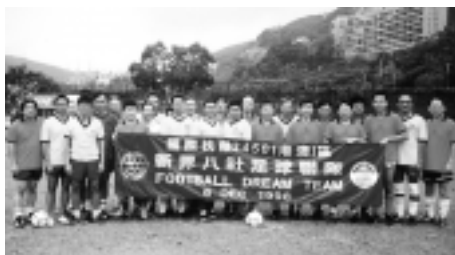
The Dream Team (orange colour uniform) pictured with team from Kowloon Area-2