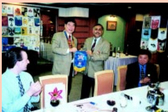
DG Visit - Rotary Club of Macau September 30, 1999