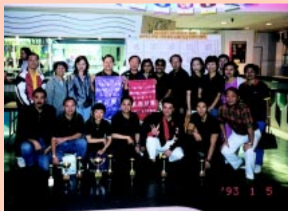
Bowling Tournament - October 3, 1999. Host Club Rotary Club of Channel Islands