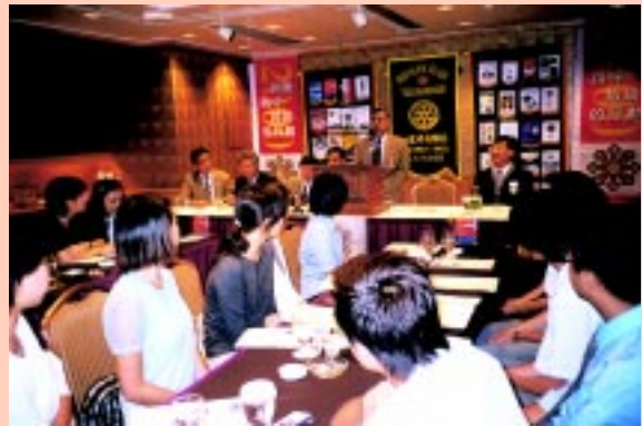
DG Visit - RC of Tolo Harbour September 20, 1999