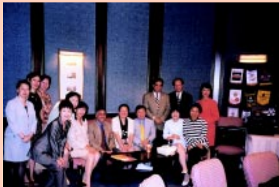
DG Visit - RC of Bayview Sunshine September 15, 1999