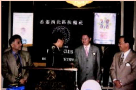
DG Visit - Rotary Club of Hongkong Northwest September 7, 1999