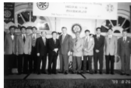
Intercity Meeting-Macau, August 26th 1999 Membership Development