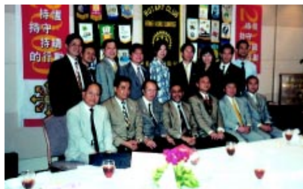
DG Visit-RC of Hong Kong Sunrise August 31st 1999