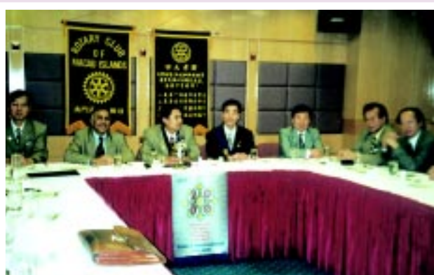
DG Visit-RC of Macau Islands August 30th 1999