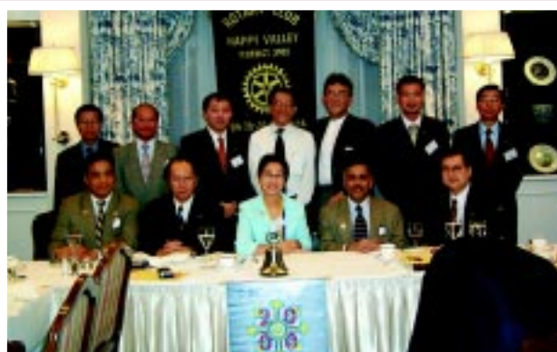
DG Visit-RC of Happy Valley September 6th 1999