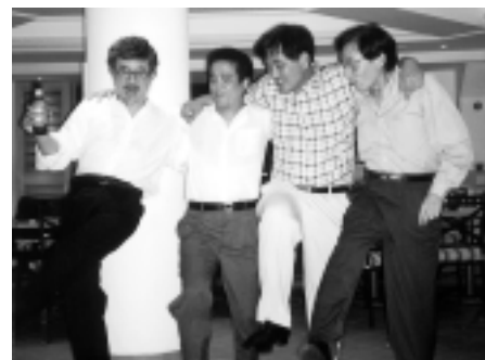
RC of Wanchai-Rotarians Having Fun July 5th 1999

This of course could result in a 100% growth for RC of Hong Kong , which might not be such a great idea. However the thought is that many of such a large inflow might be more challenged in joining clubs in the District with less Rotarians and possibly more conveniently located meeting places for their individual circumstances. This could be a boon to not only a few clubs in this area but also to many in the District. Since you will be reading this after the Membership Development Inter City Meeting on 27th August it will be interesting to compare it with those ideas that emerge from the meeting.