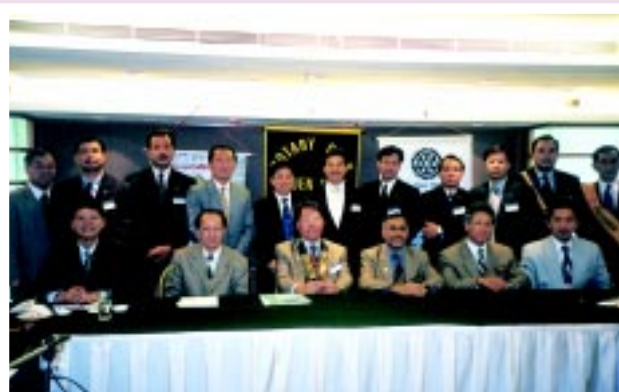
DG Visit-RC of Tsuen Wan July 26th 1999