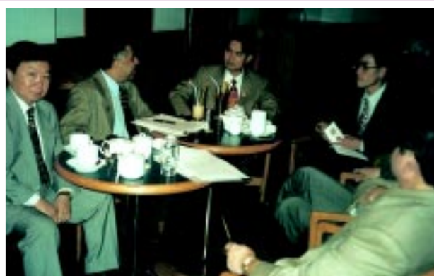
Official Visit-Working Session. Rotary Club of Macau Islands