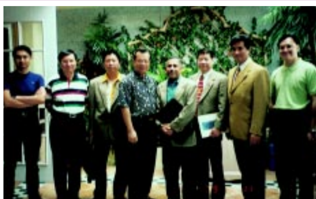
40th District Conference Planning Session In Macau