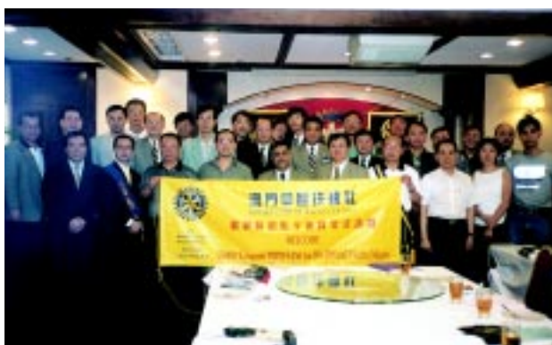
DG Visit-RC of Macau Central July 28th 1999