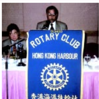
DG Visit-RC of Hong Kong Harbour August 12th 1999