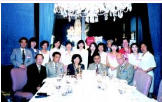
DG Visit-RC of Queensway July 29th 1999