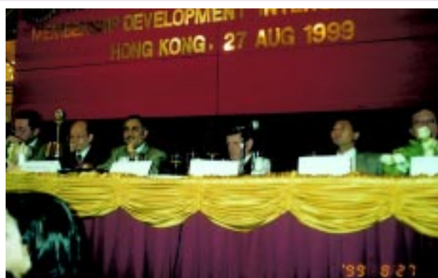
Membership Development Intercity Meeting In Hong Kong