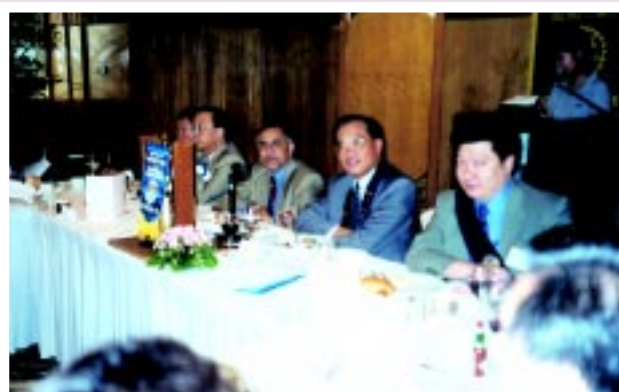
DG Visit-RC of Hong Kong North August 26th 1999