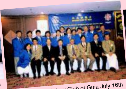
DG Official Visit Rotary Club of Guia July 16th 1999