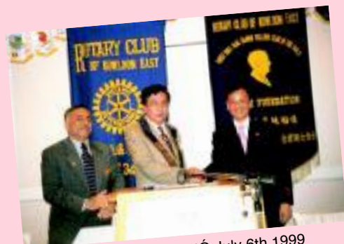
Handover ÒKowloon EastÓ July 6th 1999