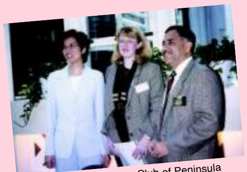
DG Official Visit - Rotary Club of Peninsula Sunrise, July 15th 1999