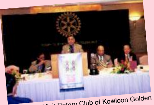
DG Official Visit Rotary Club of Kowloon Golden Mile July 21st 1999