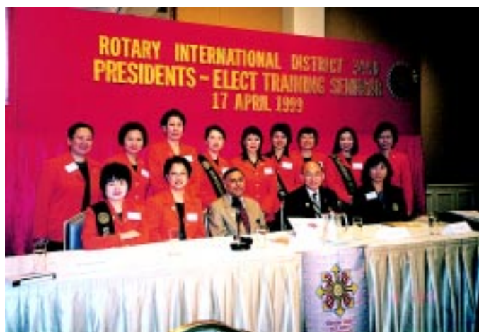
Host Club - Bayview Sunshine Hong kong

At 8.30 a.m. the now famous singers from Bayview Sunshine Club led the in-coming presidents through many inspiring Rotary Songs. This help set the mood for the work to be accomplished.