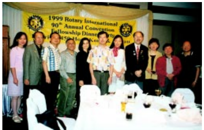
R.I. Convention - Singapore District 3450 Fellowship evening