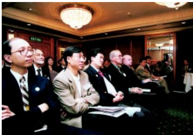
Enter To Learn