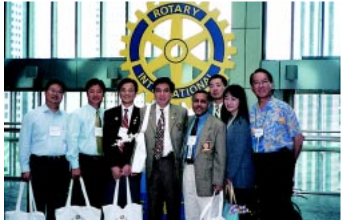
R.I. Convention-Singapore - Part of the large District 3450 delegation who attended the convention