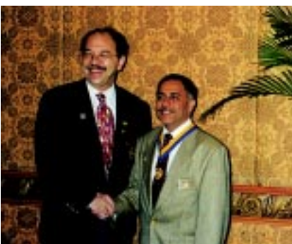
District Installation - June 30th 1999, Hand-Over

The Installation ceremony was held at the Holiday Inn Golden Mile during the regular luncheon meeting of the Rotary Club of Kowloon Golden Mile on June 30th 1999. Over 150 Rotarians