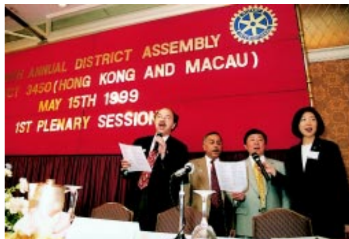
District 3450 Past, Present and The Future "CONTINUITY"