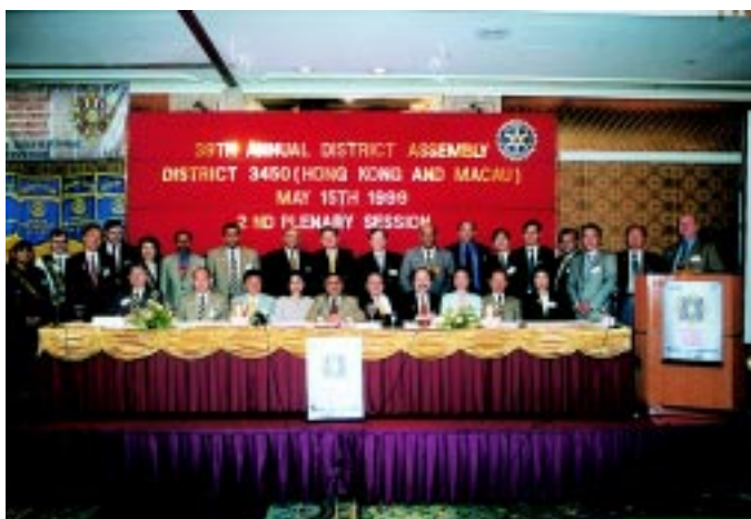
Job Well Done by All at the 39th Annual District Assembly

The 39th District Assembly of Rotary International District 3450 was held at the Holiday Inn Golden Mile, Kowloon on Saturday 15th of May 1999. As of that day the total number of Clubs in the District was 48.