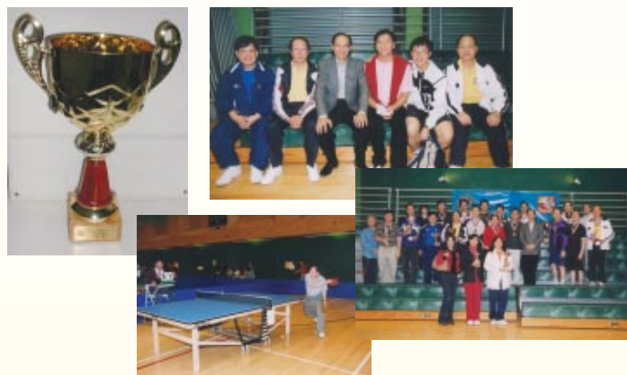
Table Tennis Results ~ December 07, 2003 乒乓球賽果

District Sports and Recreation Committee Chairman