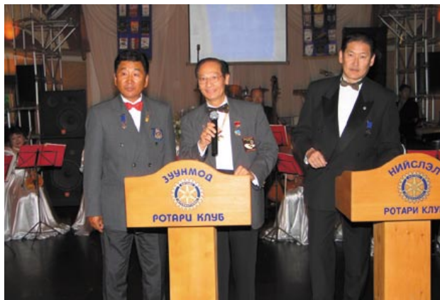
District Governor delivered speech to the 4 clubs in Mongolia, 15 August, 2003

It has been said that membership development underpins both the philosophical and operational cornerstones of Rotary International. The four Avenues of Service require an active and growing membership in order to fulfill the Object of Rotary.