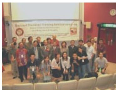
Organizing Committee and Rotarians