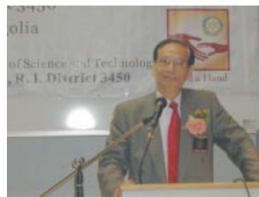
Speech by Governor Jones Wong