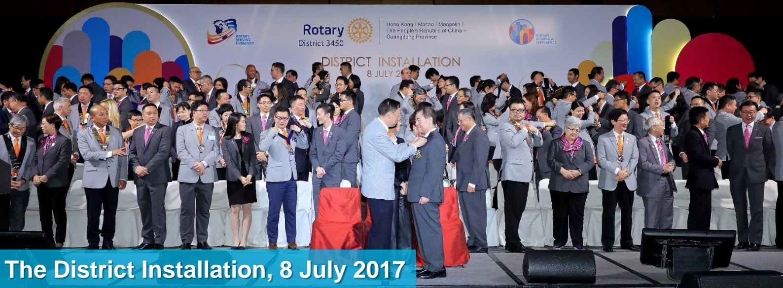
The District Installation, 8 July 2017