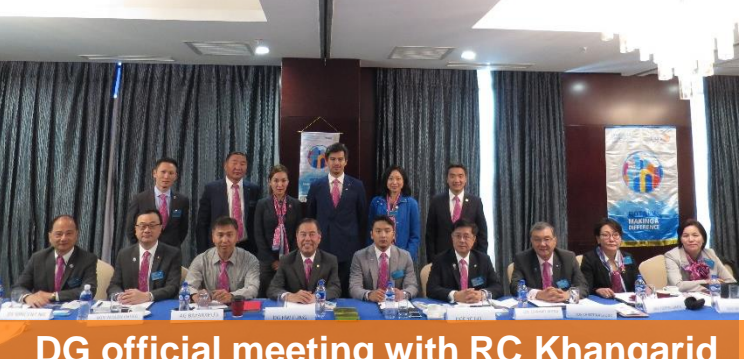
DG official meeting with RC Khangarid