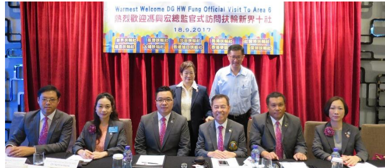
DG official meeting with RC HK Sunrise