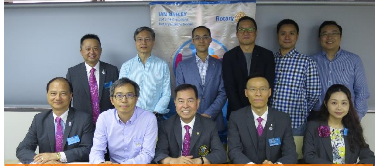
DG official meeting with RC HK North