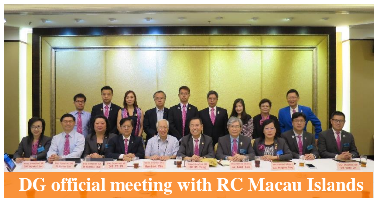
DG official meeting with RC Macau Islands