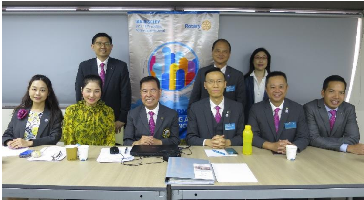
DG official meeting with RC Causeway Bay