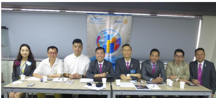
DG official meeting with RC HK Bayview