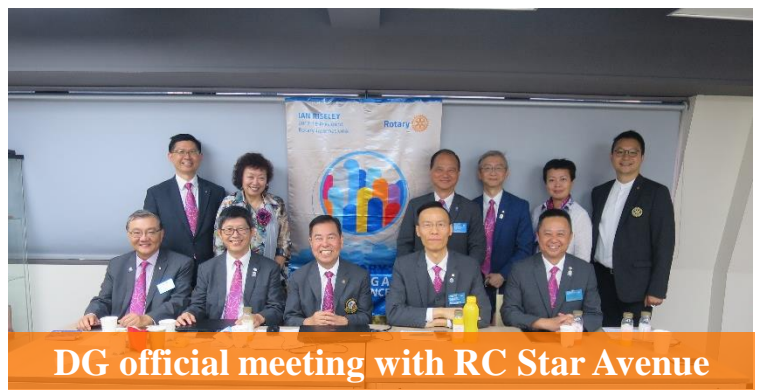
DG official meeting with RC Star Avenue