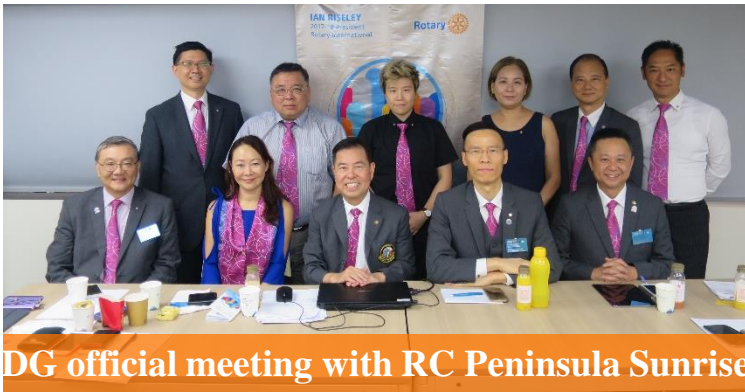
DG official meeting with RC Peninsula Sunrise