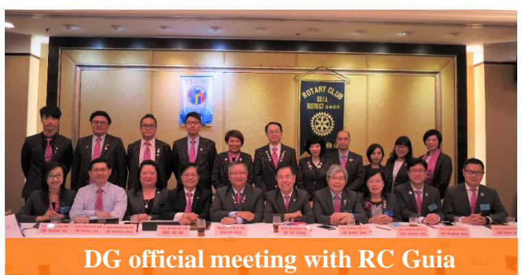
DG official meeting with RC Guia