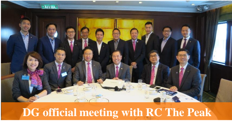
DG official meeting with RC The Peak