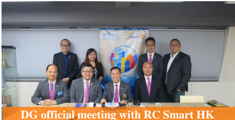
DG official meeting with RC Smart HK