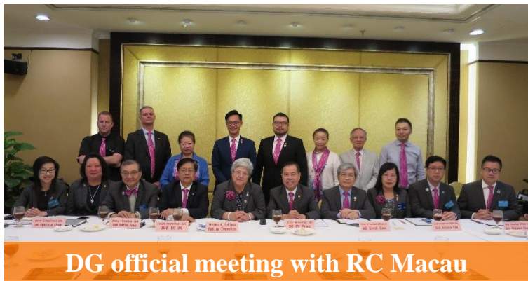
DG official meeting with RC Macau