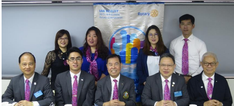
DG official meeting with RC E-Club of D3450