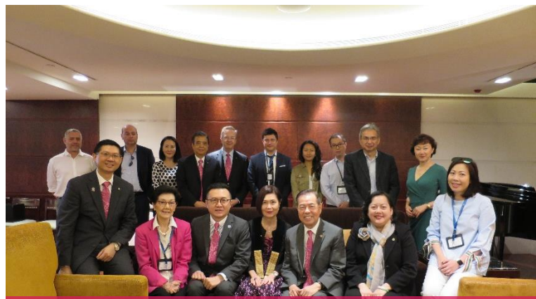
DG official meeting with members of RC Wanchai