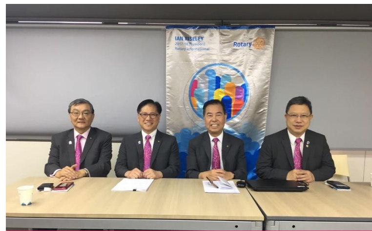
DG official meeting with RC Kowloon West