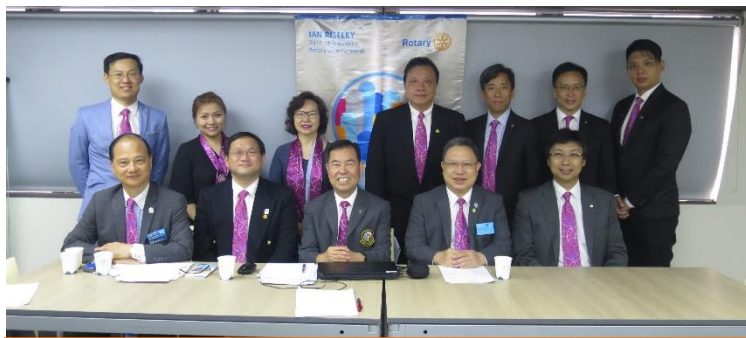
DG official meeting with RC HK Financial Centre