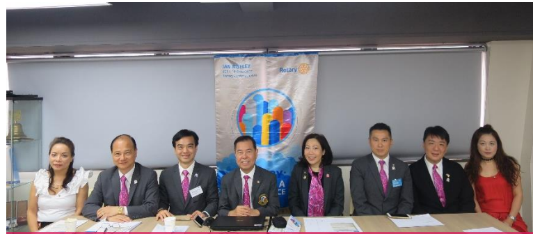
DG official meeting with RC Metropolitan HK