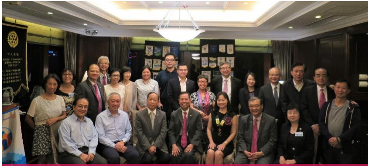
DG official meeting with RC Happy Valley