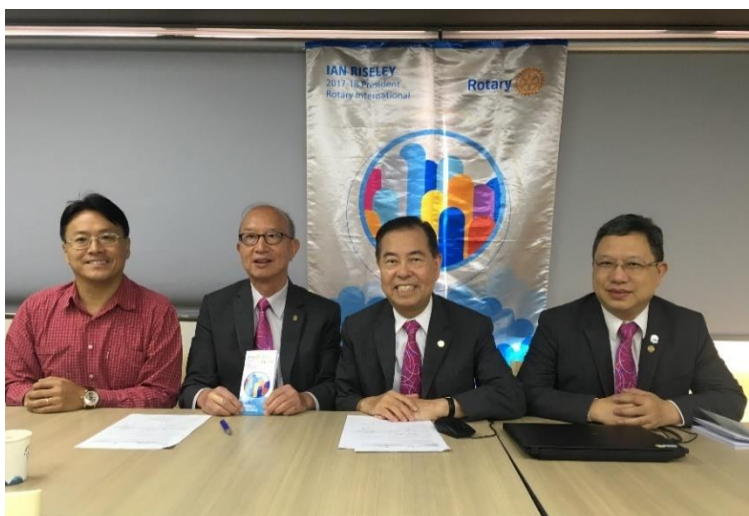
DG official meeting with RC Kowloon East