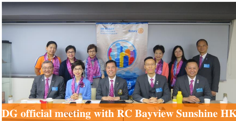
DG official meeting with RC Bayview Sunshine HK