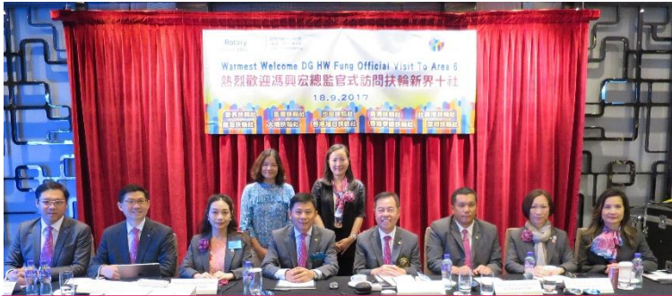
DG official meeting with RC Shenzhen