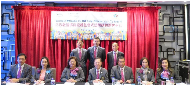
DG official meeting with RC Channel Islands