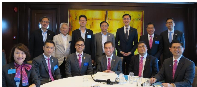
DG official meeting with RC HK Island West