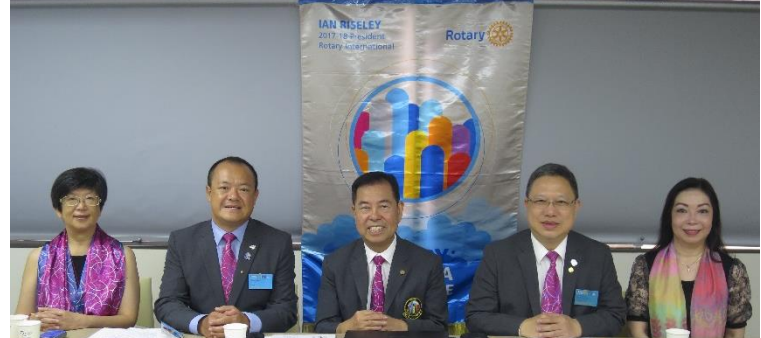
DG official meeting with E-Club of Tamar HK