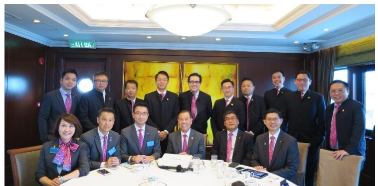
DG official meeting with RC City Northwest HK