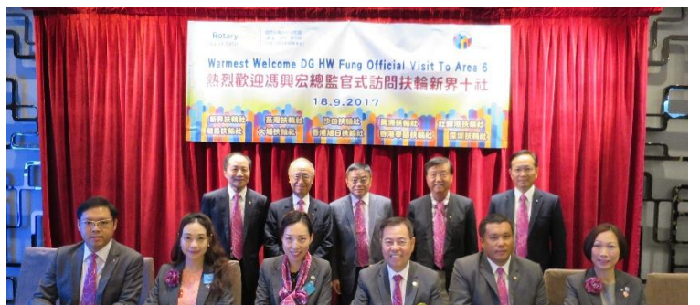
DG official meeting with RC Shatin