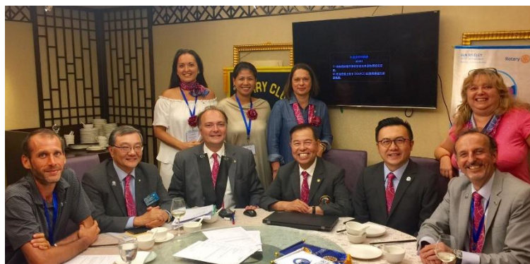
DG official meeting with RC Discovery Bay