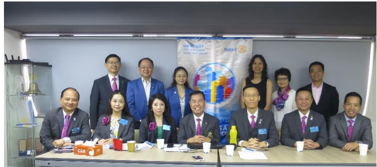
DG official meeting with RC HK City North