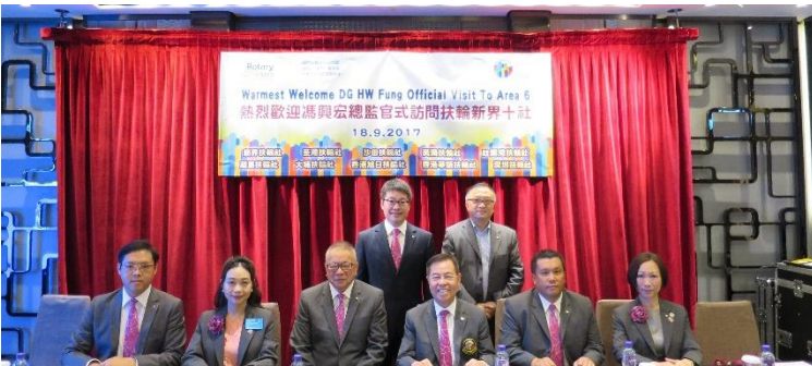
DG official meeting with RC Kwai Chung