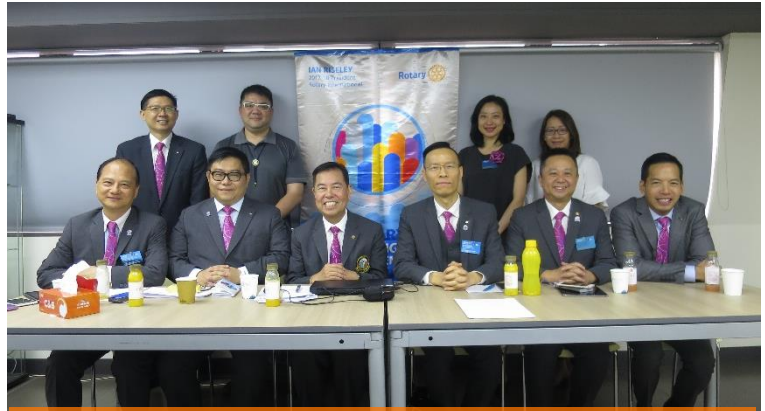
DG official meeting with RC SoHo HK