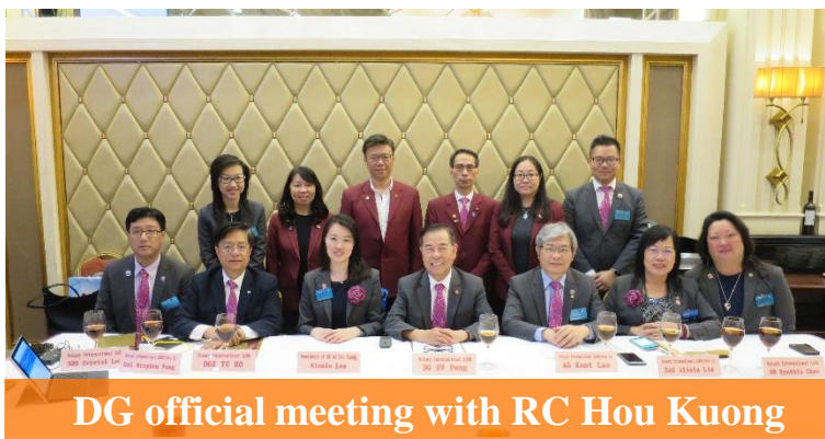
DG official meeting with RC Hou Kuong