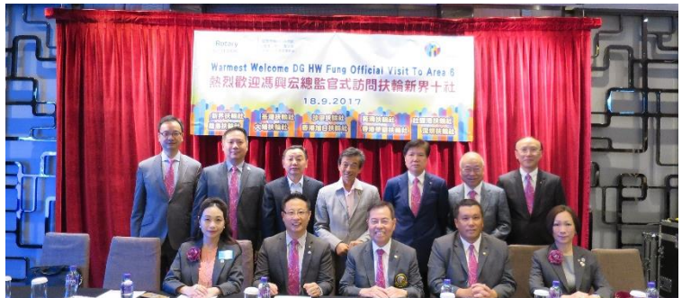
DG official meeting with RC Tsuen Wan