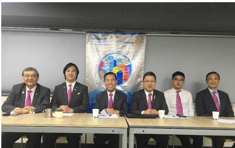
DG official meeting with RC Kwun Tong