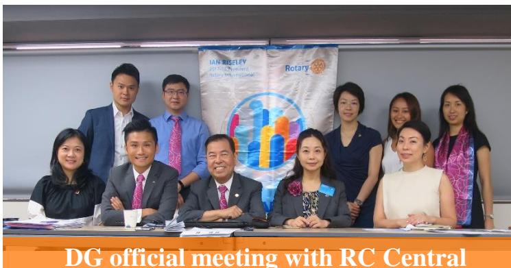
DG official meeting with RC Central