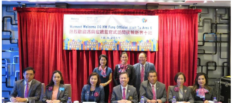
DG official meeting with RC Mandarin HK