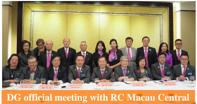
DG official meeting with RC Macau Central