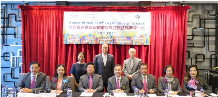
DG official meeting with RC Tolo Harbour