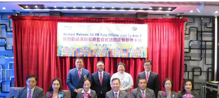
DG official meeting with RC New Territories