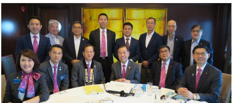
DG official meeting with RC HK Northwest