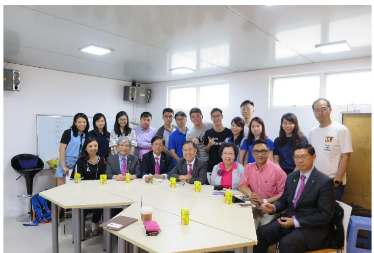
DG official meeting with Macau's Rotaract Clubs