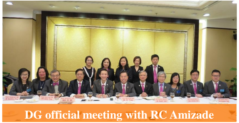
DG official meeting with RC Amizade