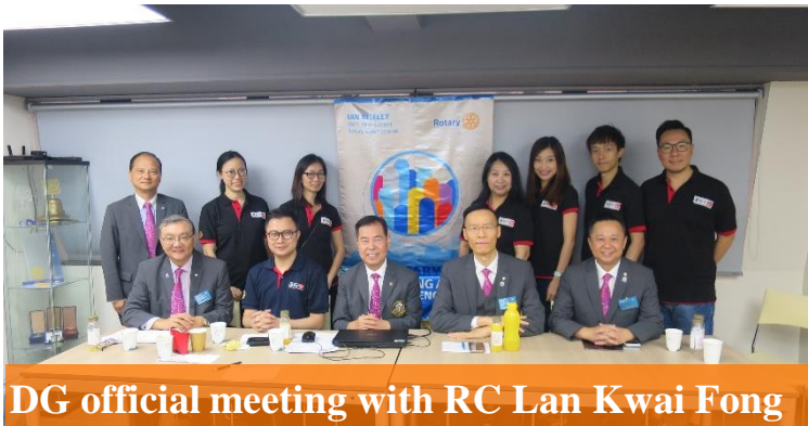
DG official meeting with RC Lan Kwai Fong