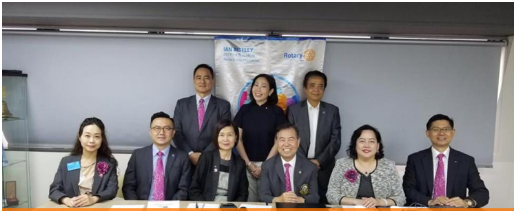
DG official meeting with RC Wanchai