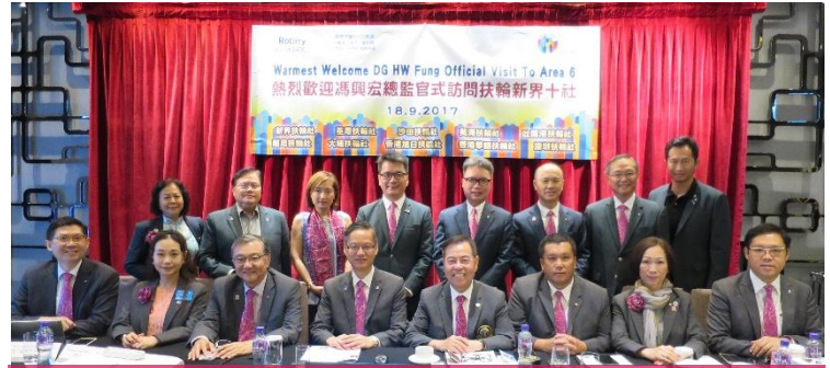
DG official meeting with RC Tai Po