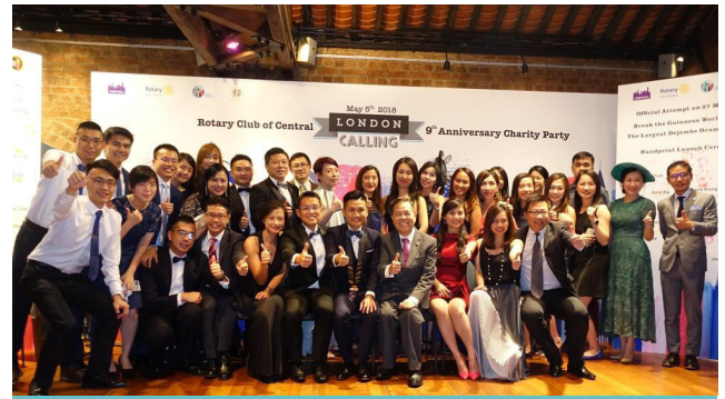
RC Central 9th Anniversary Charity Party