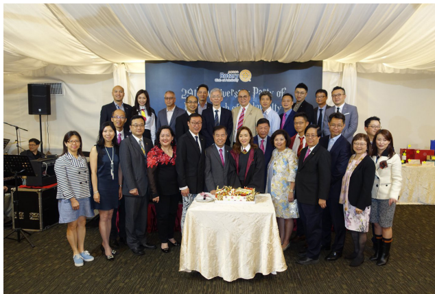
RC Admiralty 29th Anniversary Party