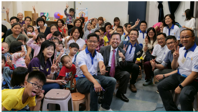
Area 7 Project with Music Children Foundation